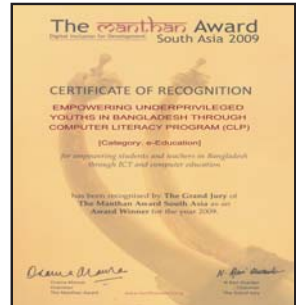
CLP received the Manthan Award in 2009